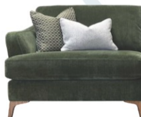
LHF/RHF cuddler end