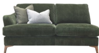
LHF/RHF 2.5 seater end