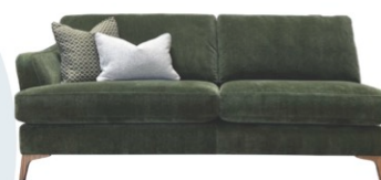
LHF/RHF 3 seater end