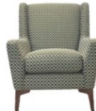
Accent chair Wooden Feet ONLY