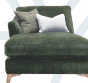
LHF/RHF chaise end