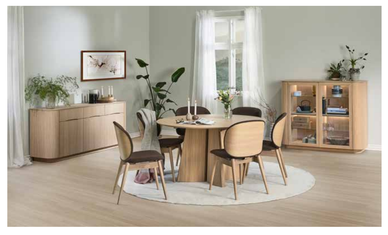
Collum Round dining table, Artus, Collum sideboards in light oak lacq.