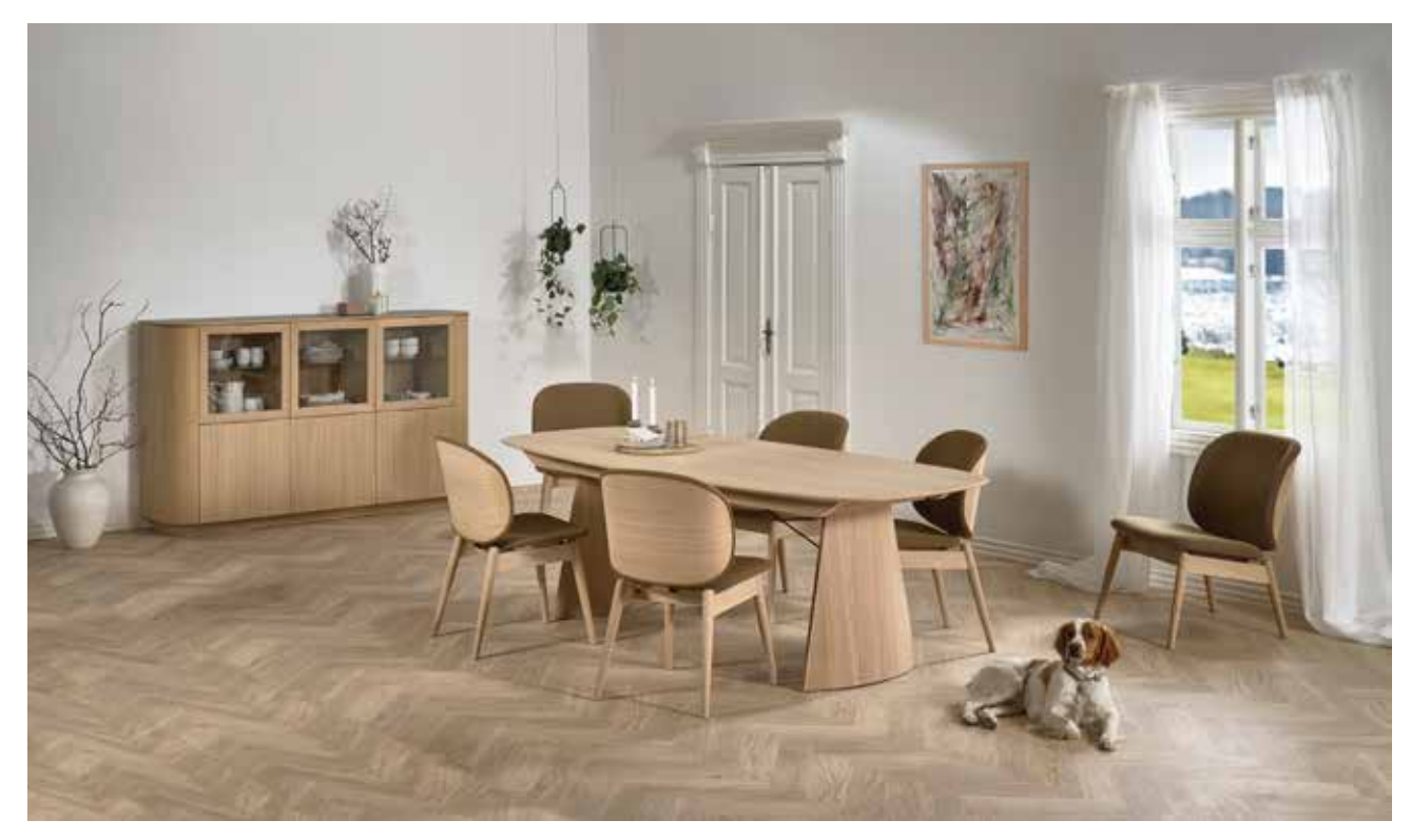
Collum Super Ellipse, Artus, Collum Display cabinet in light oak lacq.