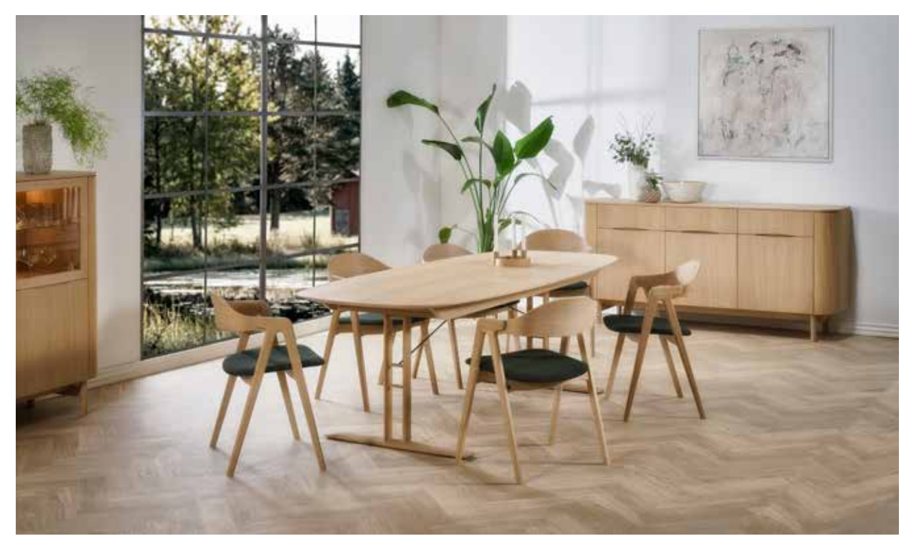
Malli Super Ellipse, Titan veneer, Malli sideboards. in Light oak lacq.