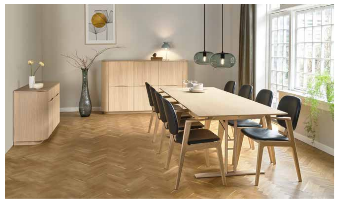
Malli dining table, Cliff arm chairs and Collum sideboards - all in light oak lacq.