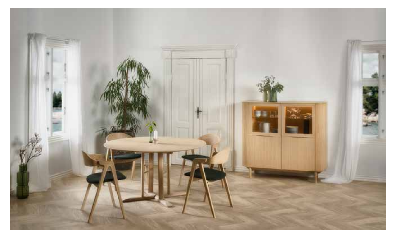
Malli Round dining table, Titan veneer, Malli sideboard in light oak lacq.