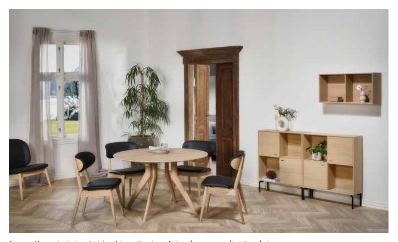
Corna Round dining table, Alius, Oculus, Artus lounge in light oak lacq.