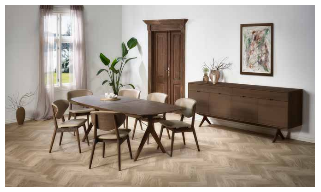
Corna Super Ellipse, Cor chair, Oculus XL-sideboard in dark oak.