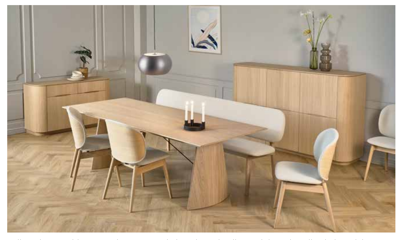
Collum dining table, Artus chairs, Comoda bench and Collum sideboards - all in light oak lacq.