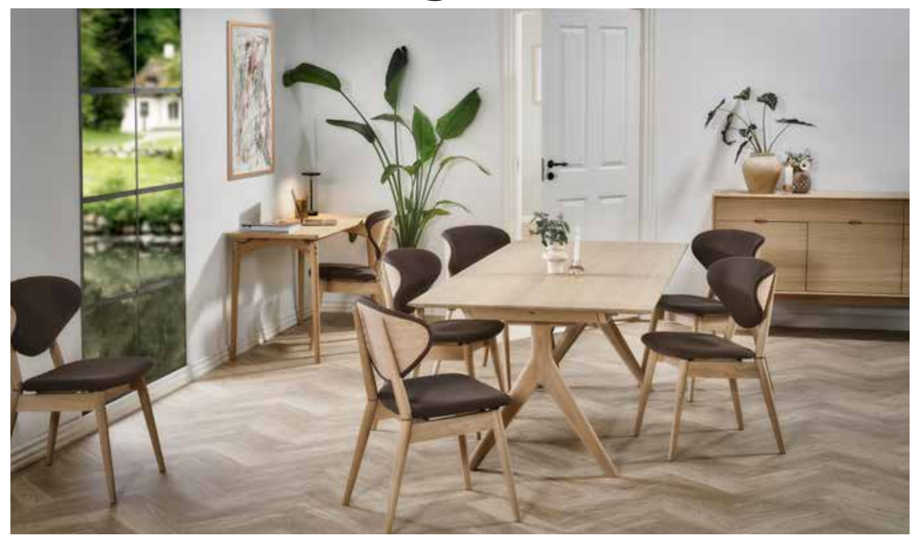
Corna dining table, Cor chair, Oculus XL-sideboard in light oak lacq.